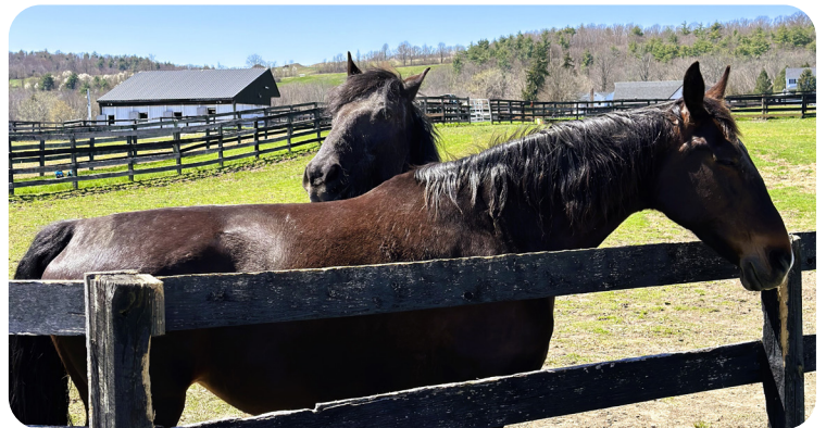
Top: Cathy spending quality time with Randy