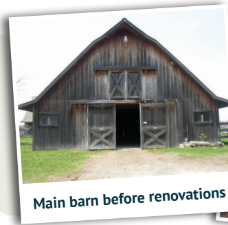
Main barn before renovations

In 2004, we established Equine Advocates Rescue & Sanctuary, a 140-acre* facility in upstate New York from which we now operate. It is an equine village where horses get to live out their lives in a natural environment that allows them to socialize with each other.