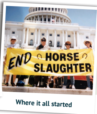
Where it all started