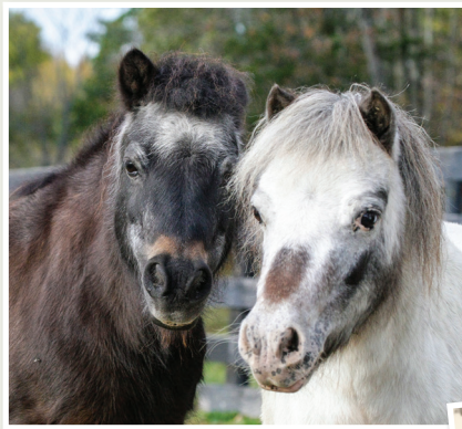
Above: Rain Man (left) with his buddy Rocket Man, a 17-year-old Miniature Appaloosa who has been with us since 2012.

Featured here are just a few of our longest-term residents. You can see their full stories, and those of ALL our residents, at equineadvocates.org .